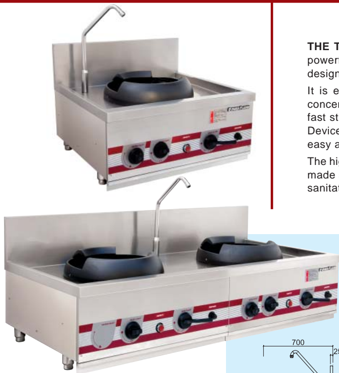
Table Top Wok Range (Jet Burner Type)

THE TABLE TOP WOK RANGE is a newly developed concept in powerful wok cooking. Its compact size and table top placement is designed to suit for different small kitchens, even in domestic.