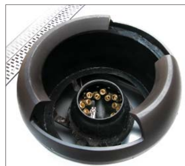
Jet burner assembly